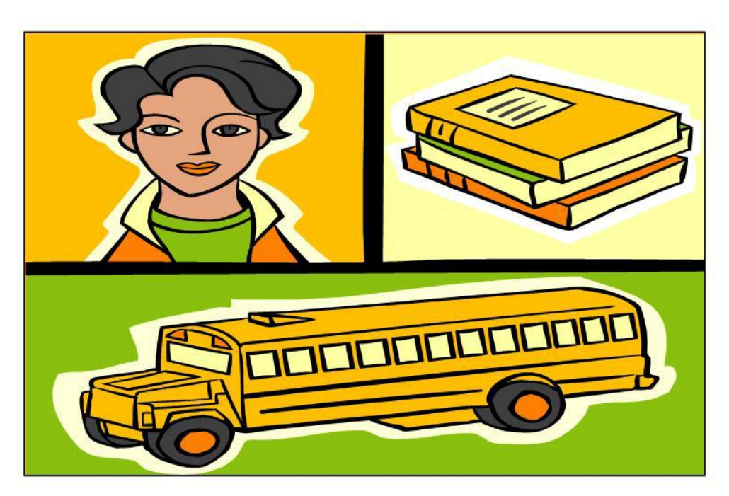
"Perfect Attendance is the Key to Graduation"