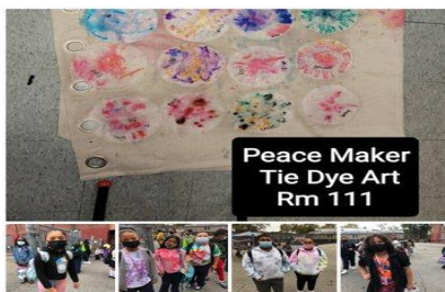
BENJAMIN FRANKLIN SCHOOL

Celebrating and Educating Awareness Anti Bullying Prevention Month