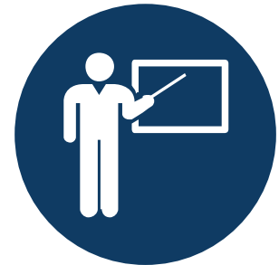
Instruction & Program