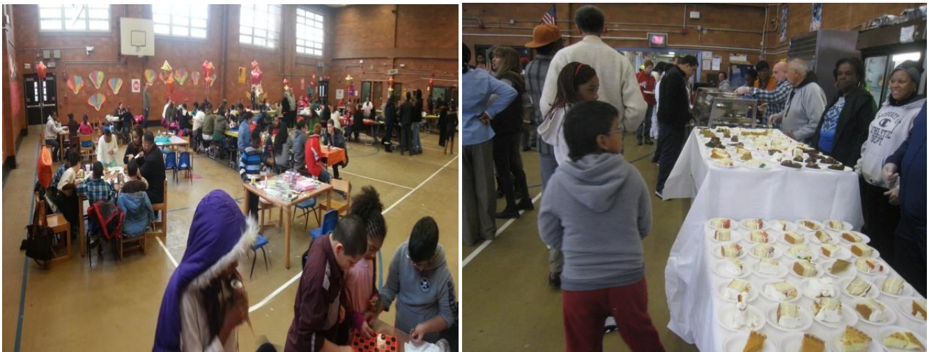
Thanksgiving Dinner 2014