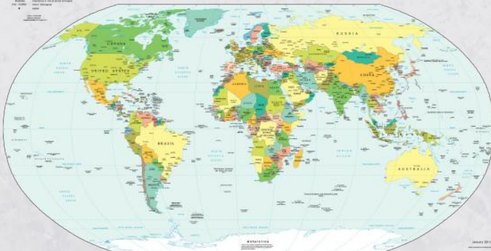
Political Map of the World, January 2015

A total of 26 families reached out to Biden in a letter demanding he bring these Americans back home. Many criticized the “bureaucratic process” and say that American citizens are being put on “the back burner” once again.