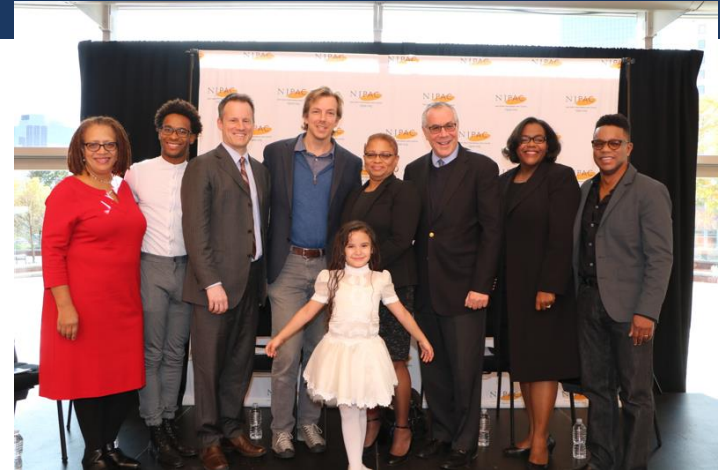
“$450K grant will introduce Newark students to NJPAC”