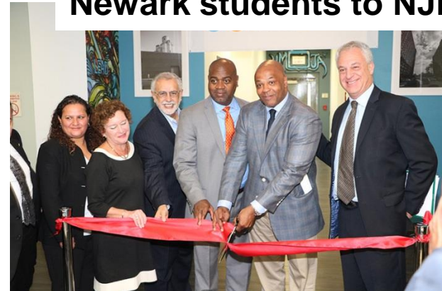
“New center aims to help high school dropouts get diplomas, jobs”