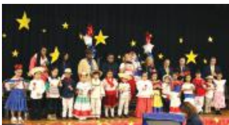
Members of the Board join in the celebration of the renaming of N. 10th Street School to Salomé Ureña School.